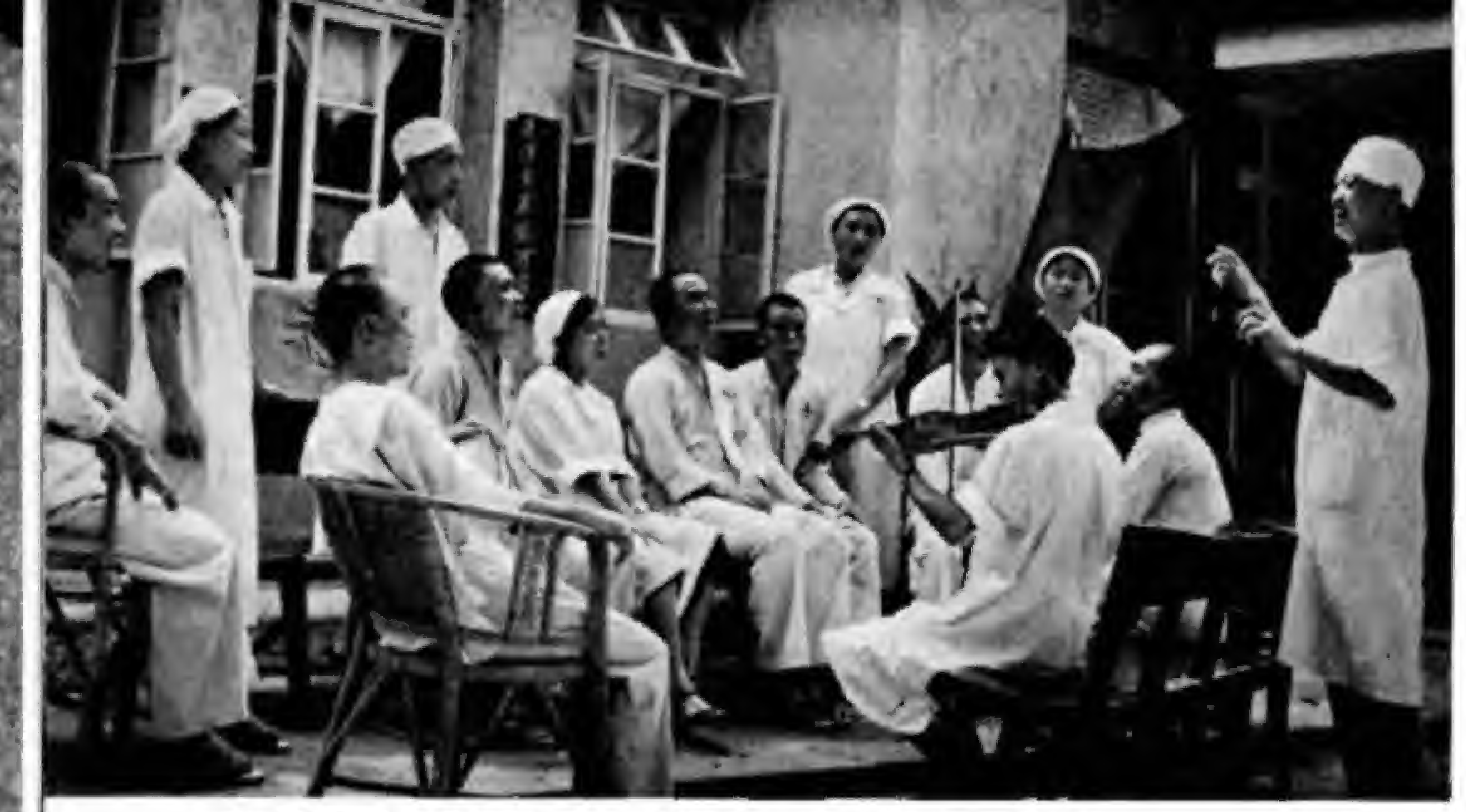
The injured workers sing revolutionary songs to express their infinite love and gratitude to the Party and Chairman Mao.